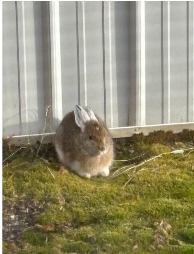
JAMAL SITTING IN HIS CORNER

If you want to feed him, then there are some foods to avoid which include: carrots which are not found naturally in his environment and could cause him to not eat grasses which are not as sweet, bananas are also not very good for him, avocados, chocolate, onions, leeks, garlic, meat, eggs, dairy, beans, rhubarb, and iceberg lettuce to name a few. You can feed him things like alfalfa, grasses, clover, hay, and most leafy greens.