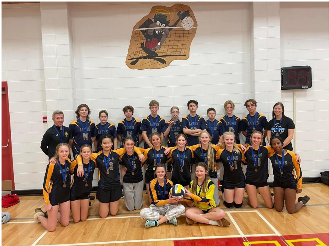
A Girls and Boys teams at Zones