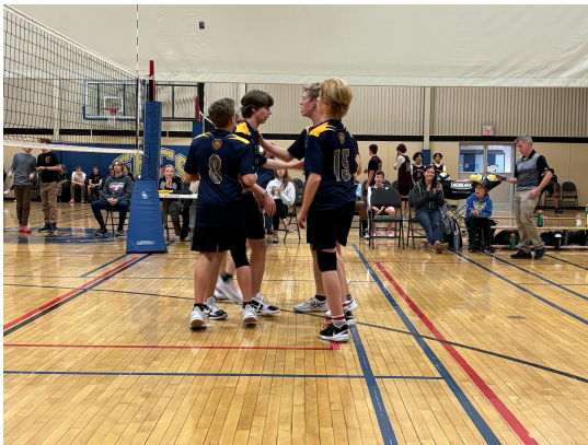
A boys got Silver at Zones and came in Fourth in their division