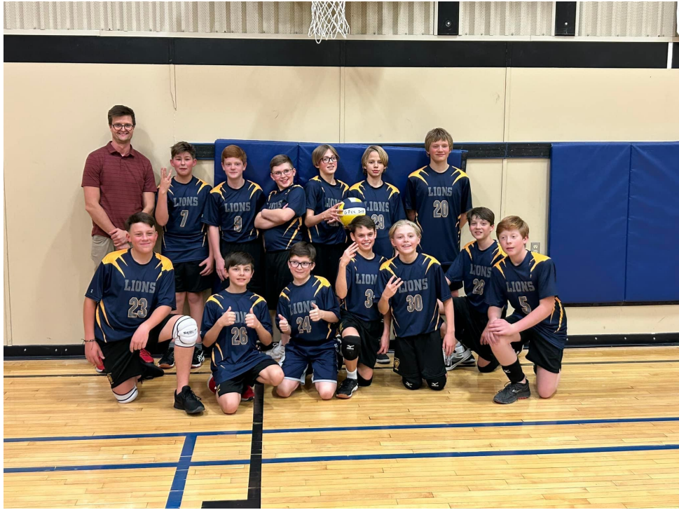
The B boys got bronze for the city division.