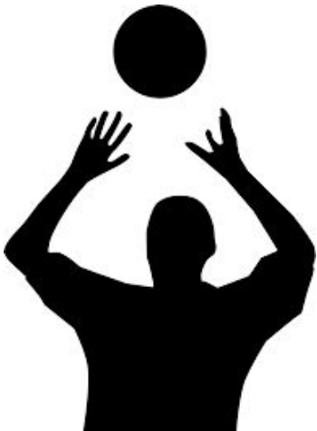
The A girls got Bronze at Zones and came in 5th in the league.